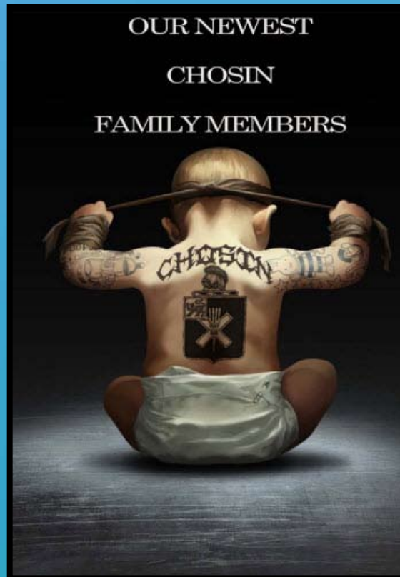
OUR NEWEST CHOSIN FAMILY MEMBERS