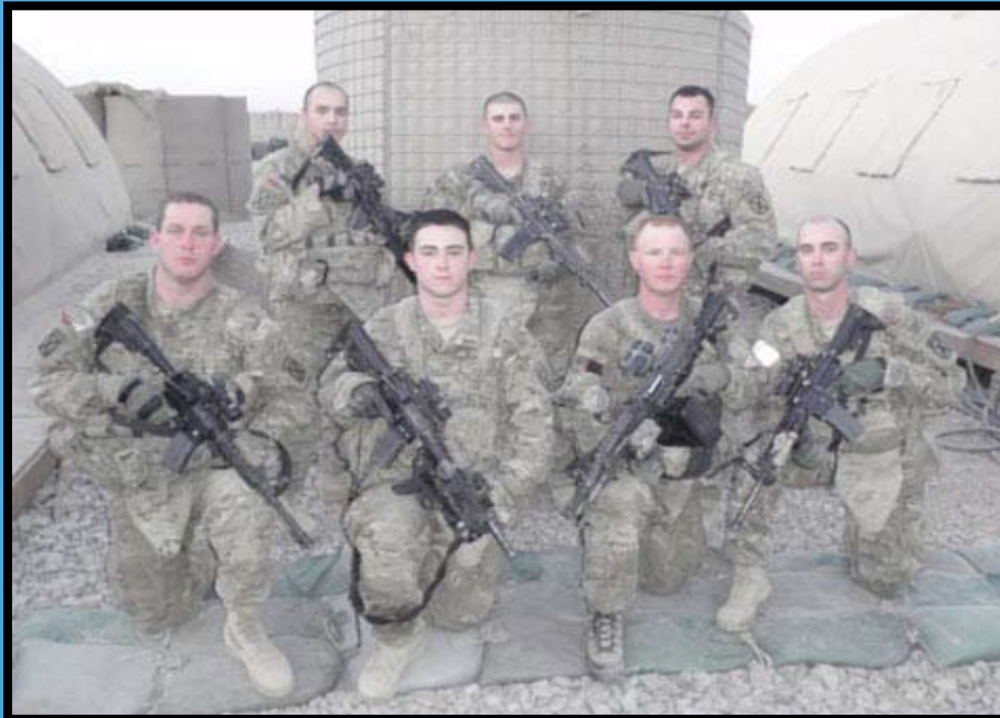
2nd PLT DOG